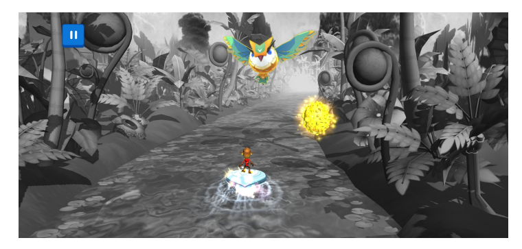
When the hover pod locks on to a Guide and captures it, EndeavorOTC has recognized that you have reached a new ability level in your play.

The hover pod's capture ray will automatically lock on when you get close to the Guide . If you remain locked on for a few seconds, you will capture the Guide and earn a Gem. Gems can be hard to get – and each one will be harder to get than the previous one.